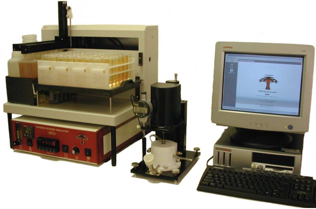
Configuration for Fully Automated Mode of Operation